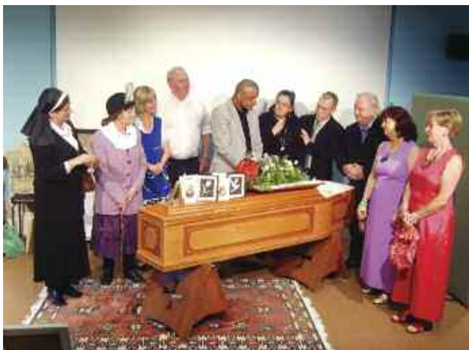
A scene from Chalkballs presented by HACE and St. Vincent's Trust