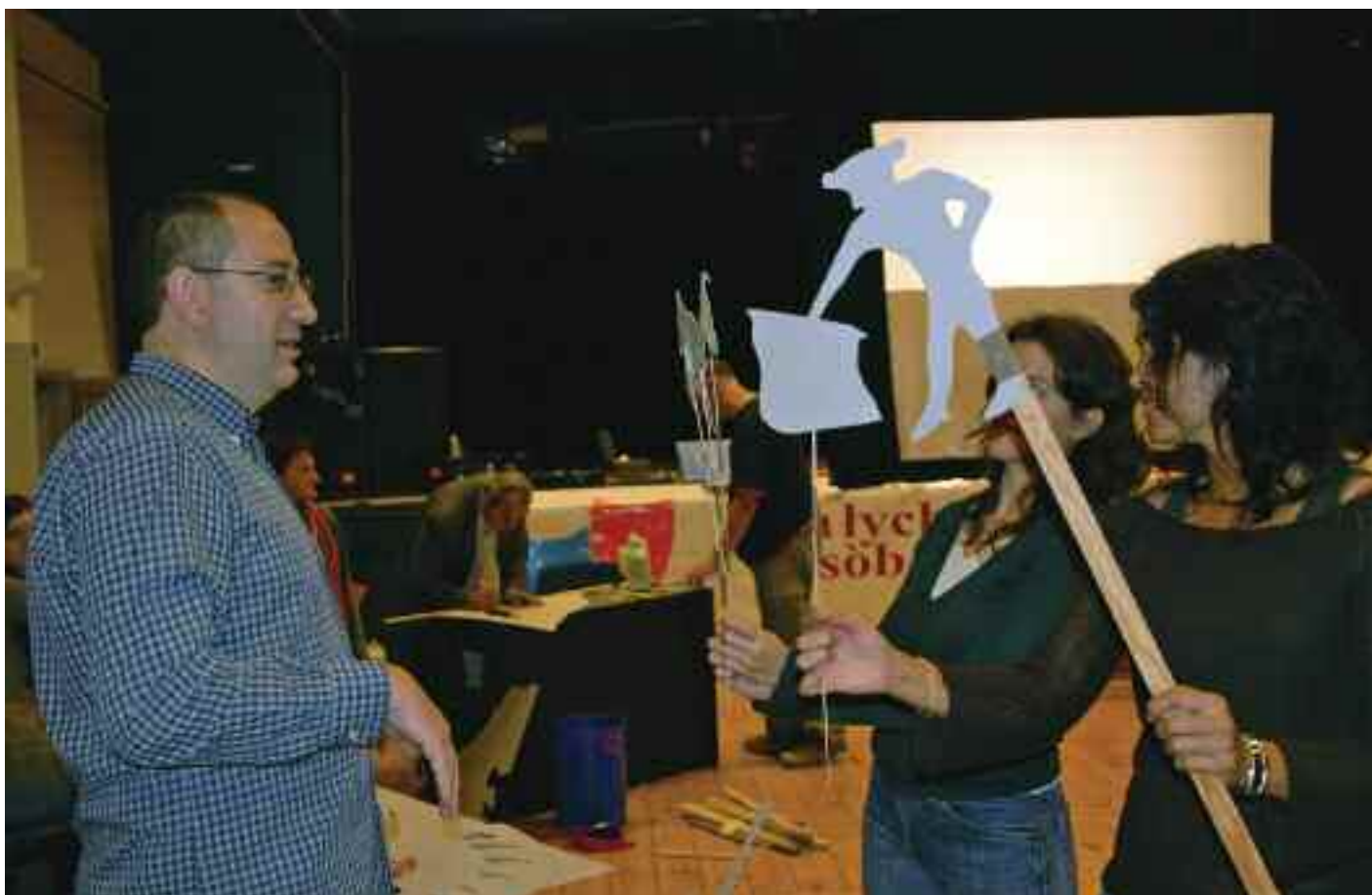
Group Members from Spain at the Shadow Puppet Workshop in Poland

The players are given an identity, which may be an occupation or personality. One player is chosen to be host of a party. Guests arrive and should show who they are without saying it directly. The host has to try to guess the identity of his/her guests.