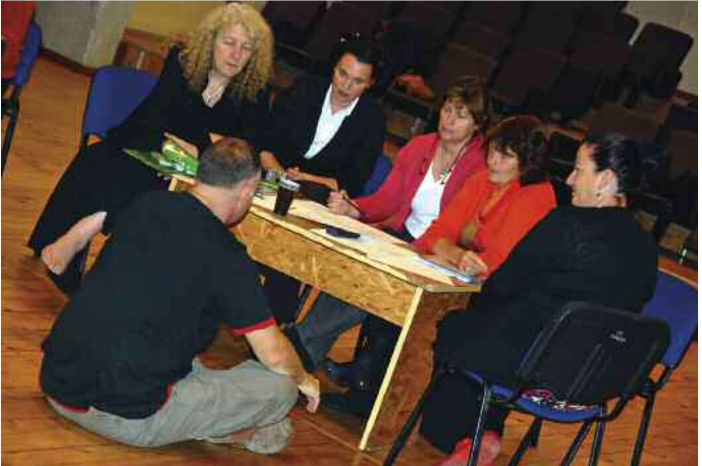
Group Members from Ireland at the Shadow Puppet Workshop in Poland