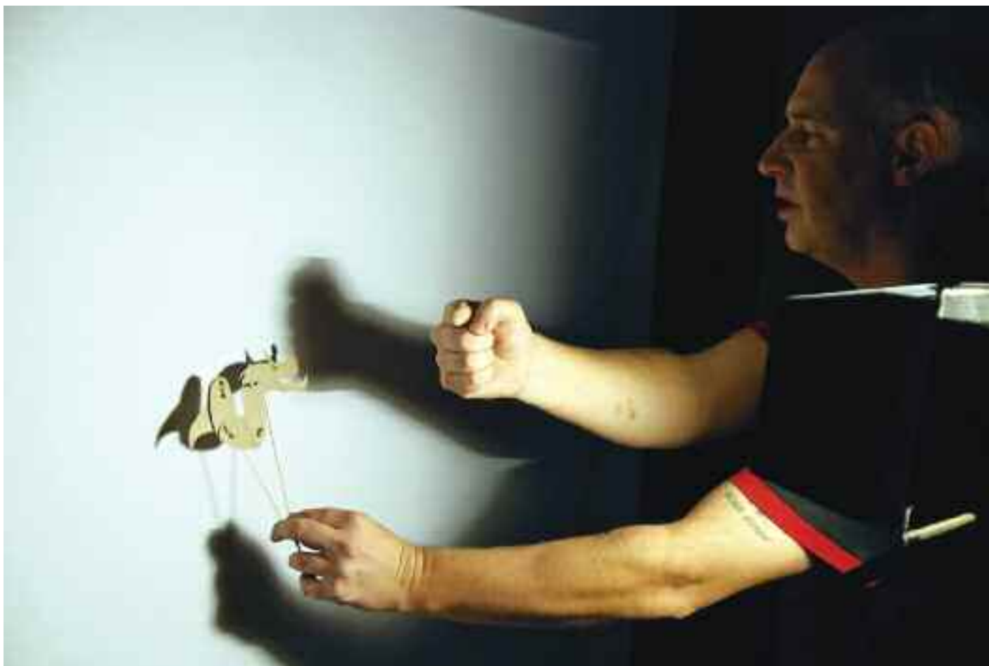
Shadow Puppet Workshop

spontaneously, the hidden possibilities revealed, of dreams, overcoming set-backs, they are liberated in the process of activity.