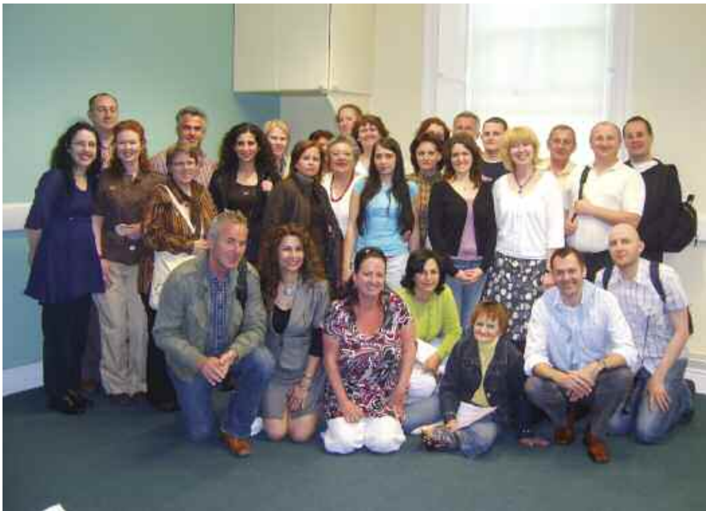
Members from the Different Partner Groups visit Smashing Times Theatre Company in Ireland