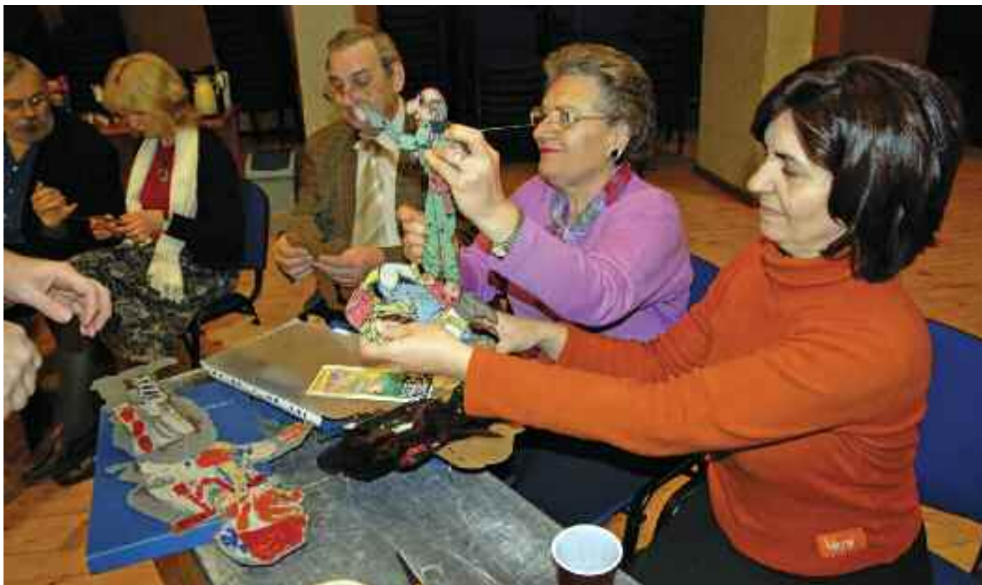
Group Members from Greece at the Shadow Puppet Workshop in Poland