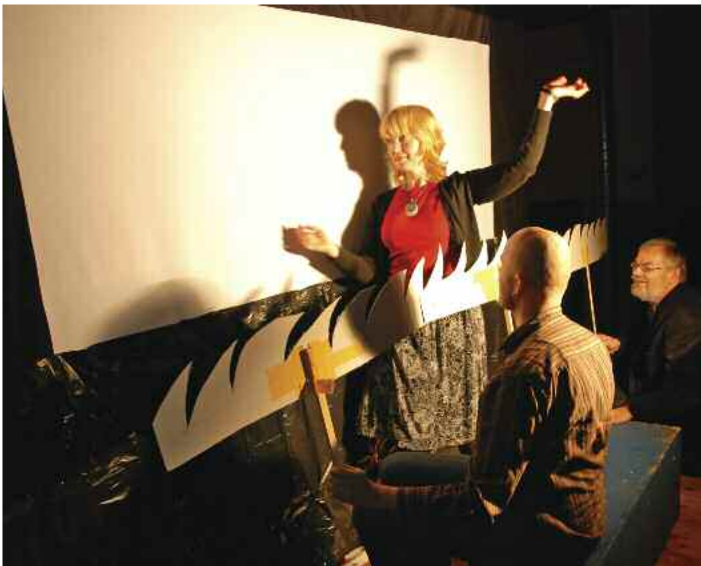
Group Members from Finland Work with Shadow Puppets in Poland