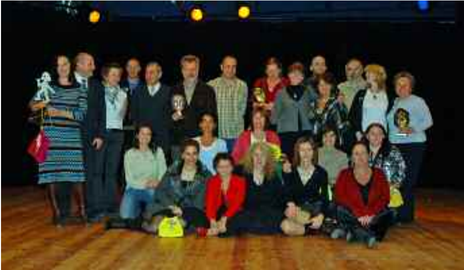
Members from the Different Partner Groups visit Poland