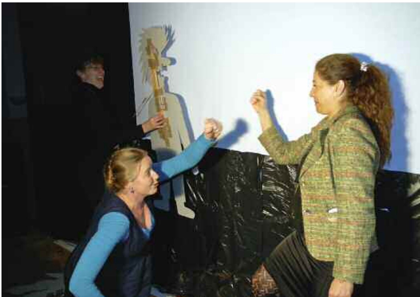
Group Members from Norway working with Shadow Puppets in Poland