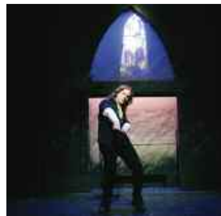
Dundalk Crossover group member.

Through accident rather than design, two of the Crossover groups have been all-female.